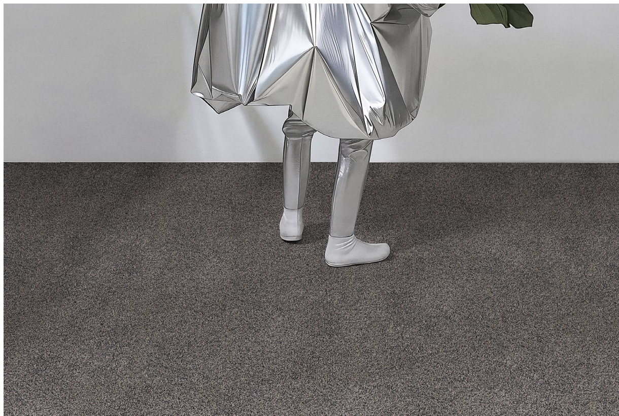
HELIX DUOO | OBJECT CARPET