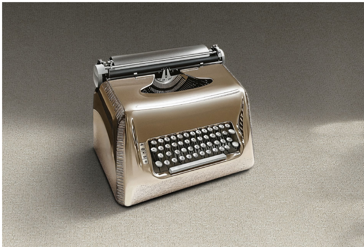
PARADOX DUO | OBJECT CARPET