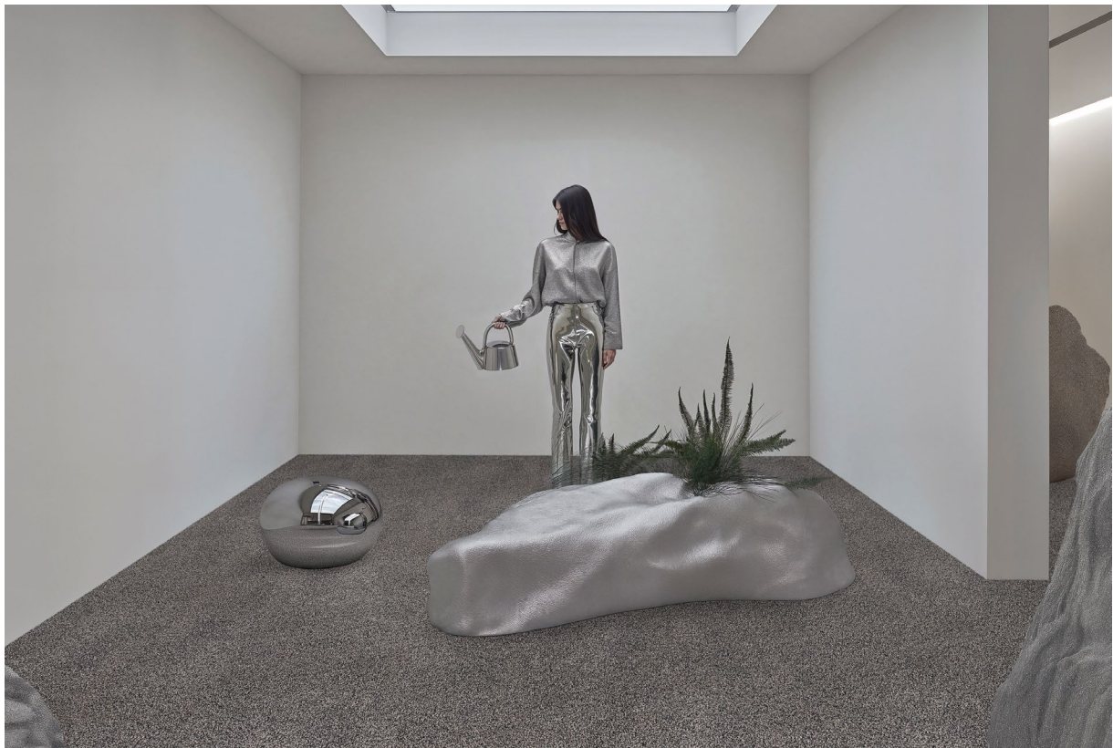
HELIX DUOO | OBJECT CARPET