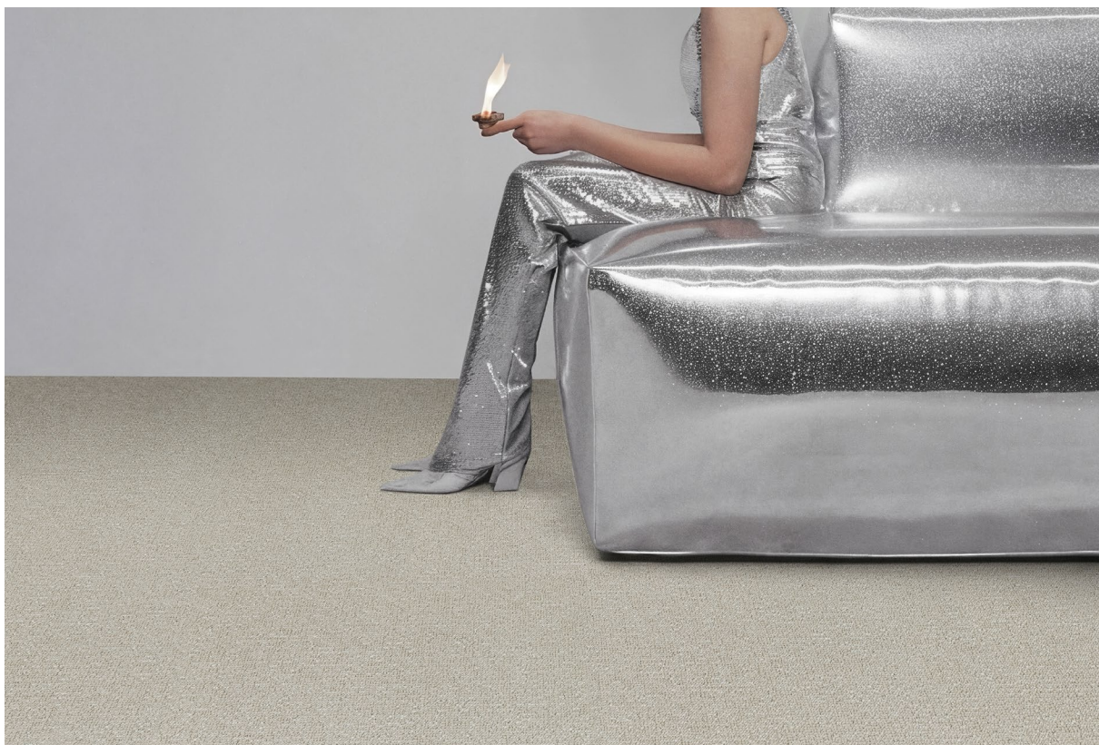
PARADOX DUO | OBJECT CARPET